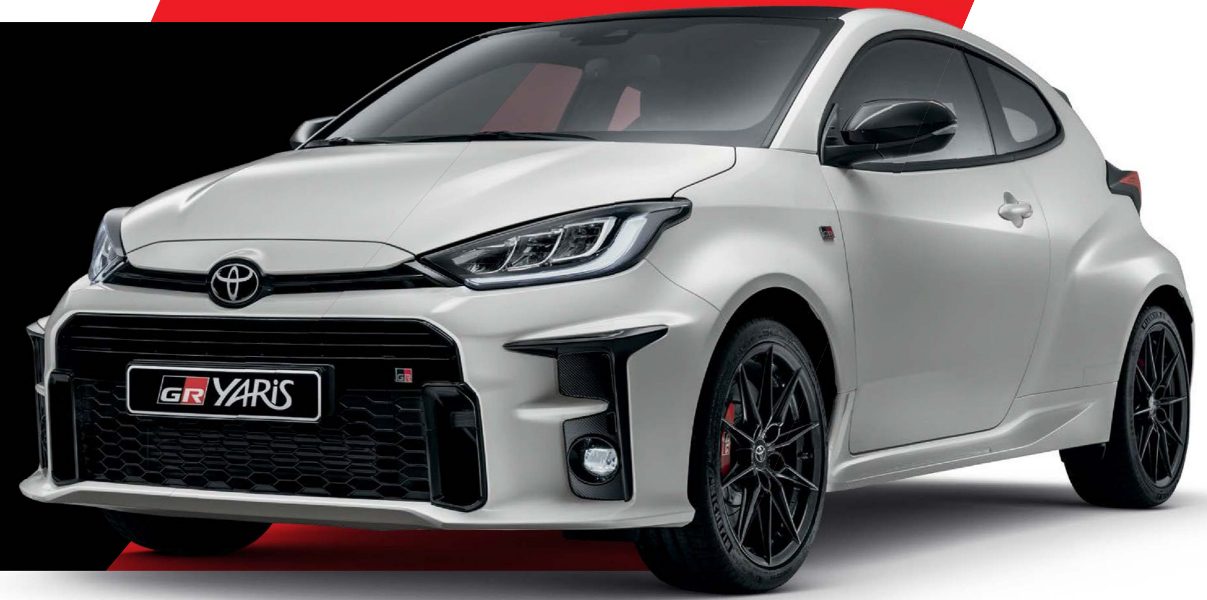
Model shown: GR Yaris Rally