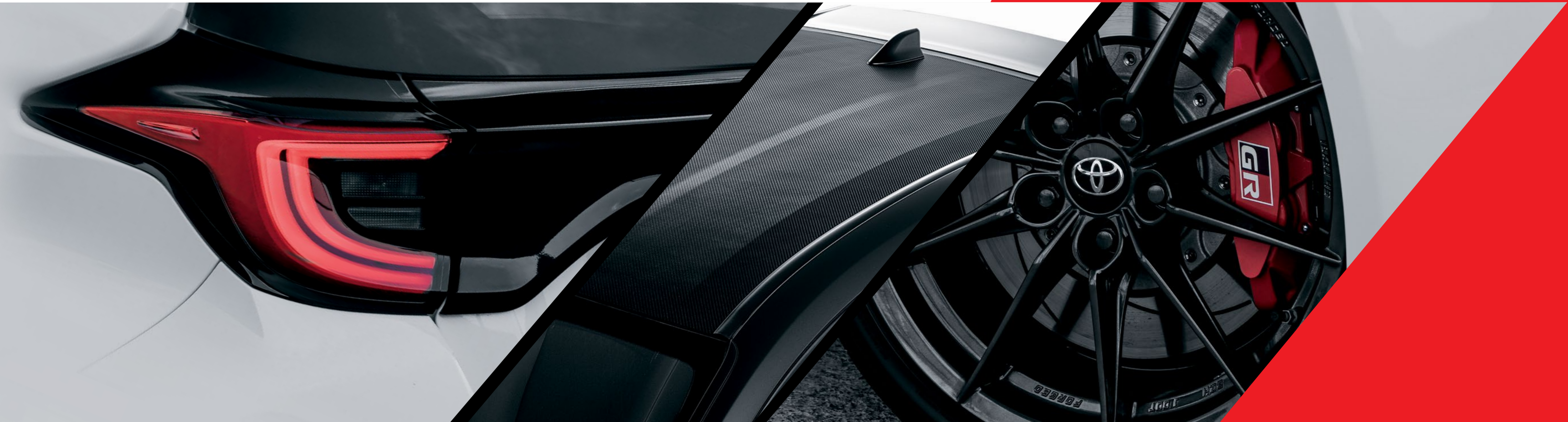
Model shown: GR Yaris Rally