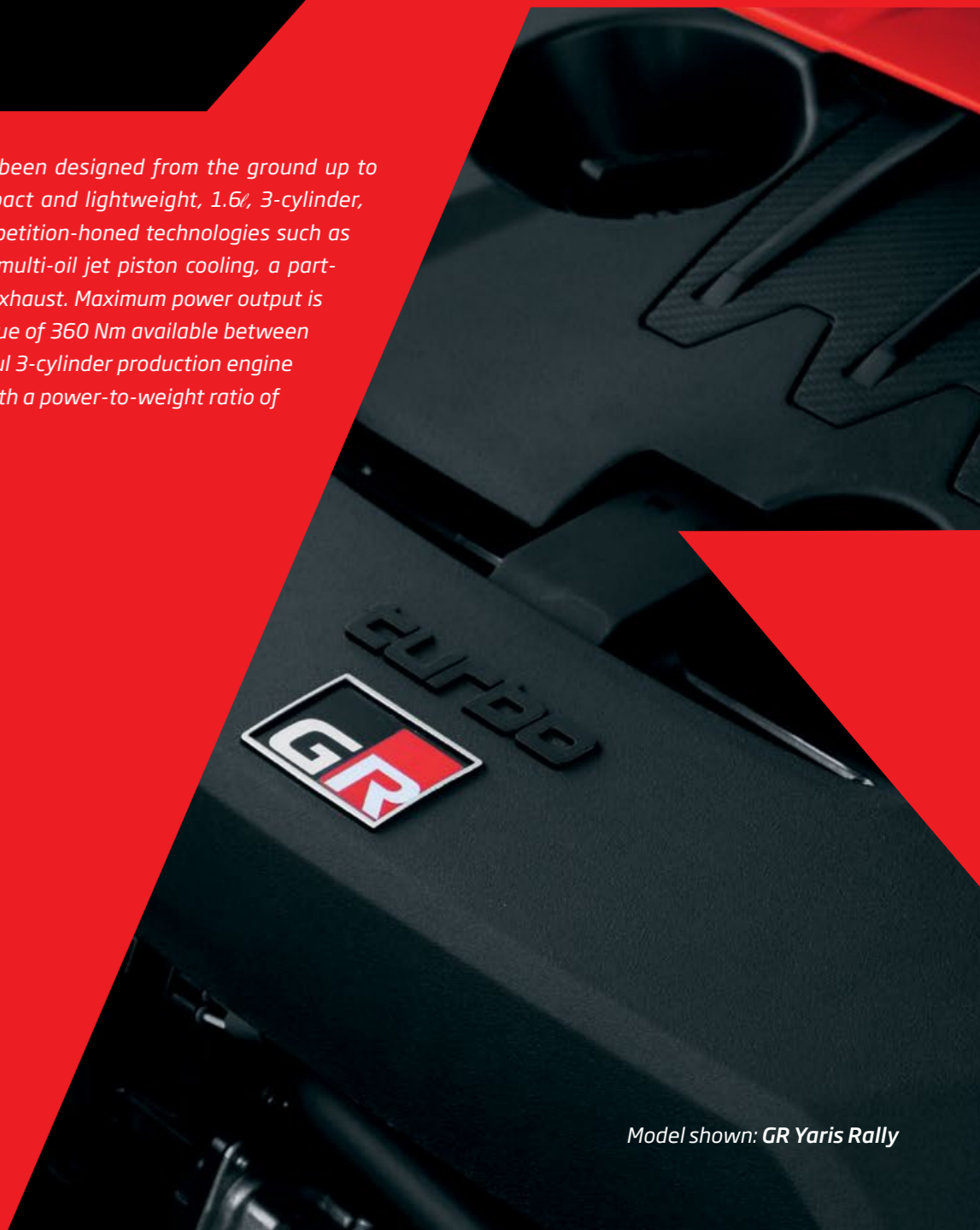
Model shown: GR Yaris Rally

Introducing one of the most powerful production 3-cylinder engines in the world. At Gazoo Racing, we believe that racing improves the breed. That's why Gazoo Racing-enhanced road vehicles like the GR Yaris Rally personify the achievements of Toyota's victories at some of the world's most gruelling motorsport events, such as the Dakar Rally, the 24 hours of Le Mans and the World Rally Championship.