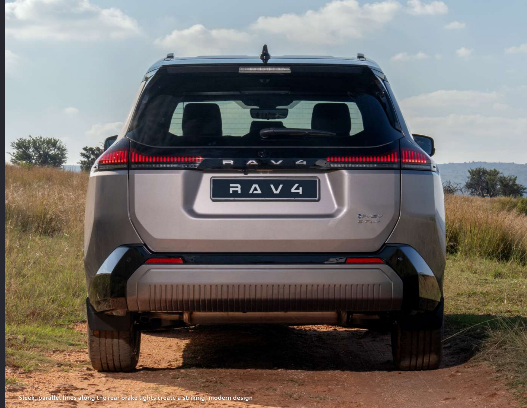
Sleek, parallel lines along the rear brake lights create a striking, modern design

Angular door lines enhance the RAV4's profile, and a bumper design that separates the brake lights create a distinctly futuristic look. GX and VX models sport striking 5-spoke, 18-inch alloy wheels while the flagship PHEV features a more athletic 20-inch alloy wheel design.