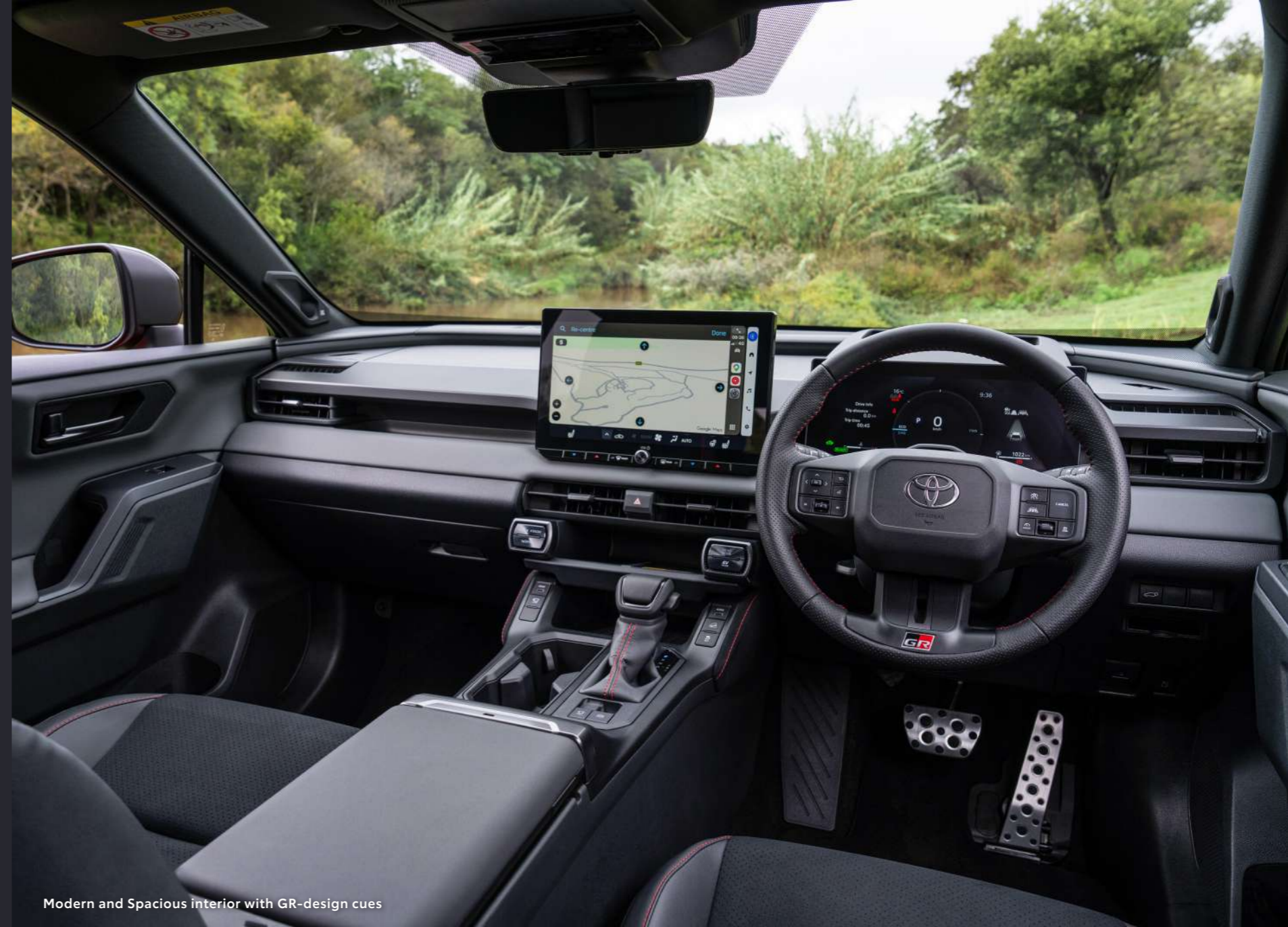
Modern and Spacious interior with GR-design cues

Heated sports front seats are covered with Ultrasuede® and trimmed with red leather stitching, as are the gear selector and steering wheel (also heated) equipped with shift paddles for a more immersive yet luxurious drive.