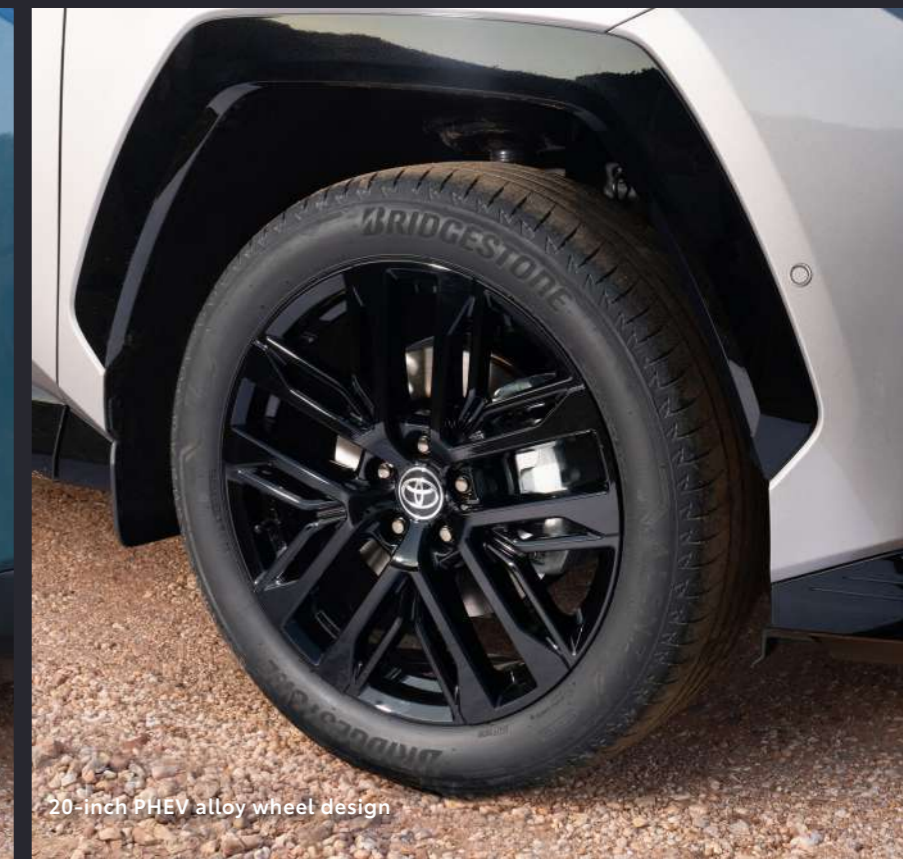
20-inch PHEV alloy wheel design