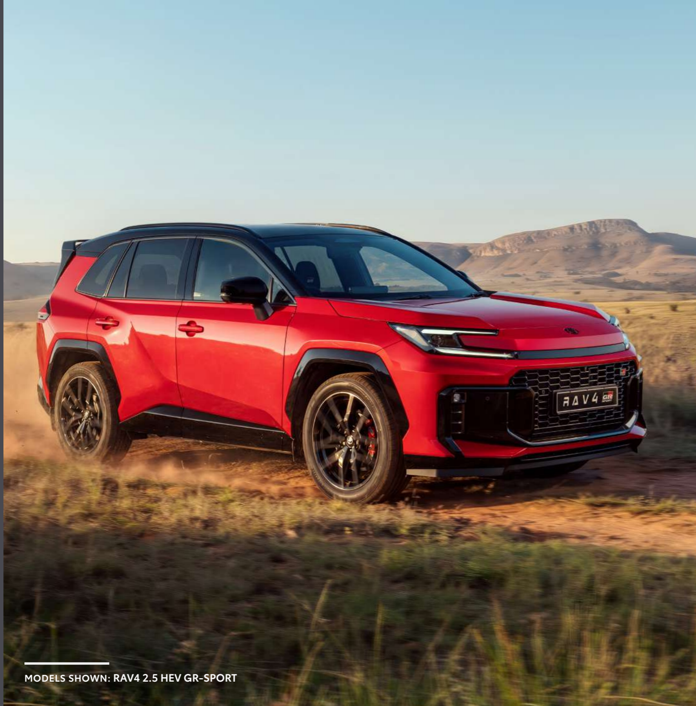
MODELS SHOWN: RAV4 2.5 HEV GR-SPORT