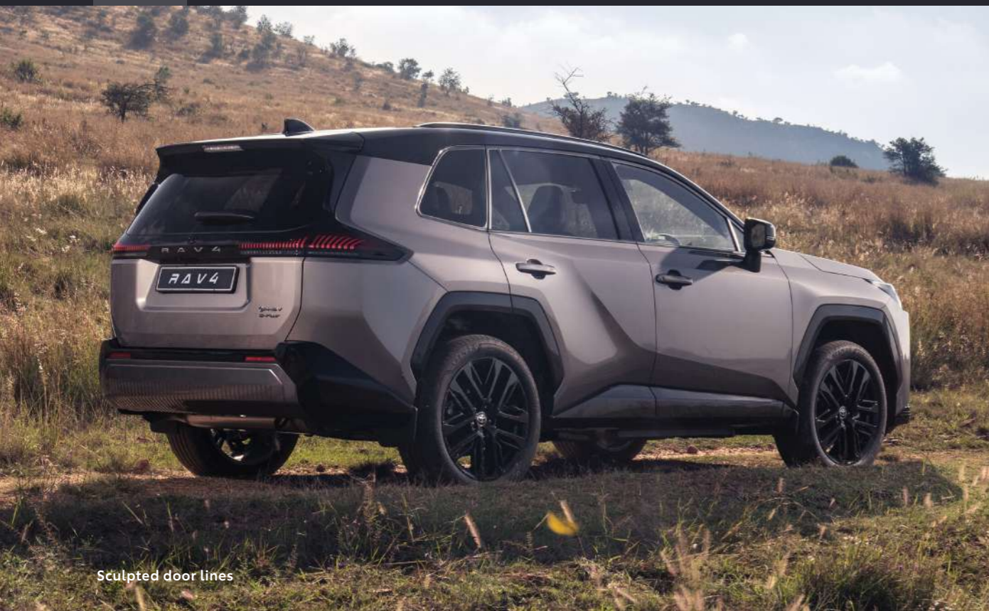
Sculpted door lines