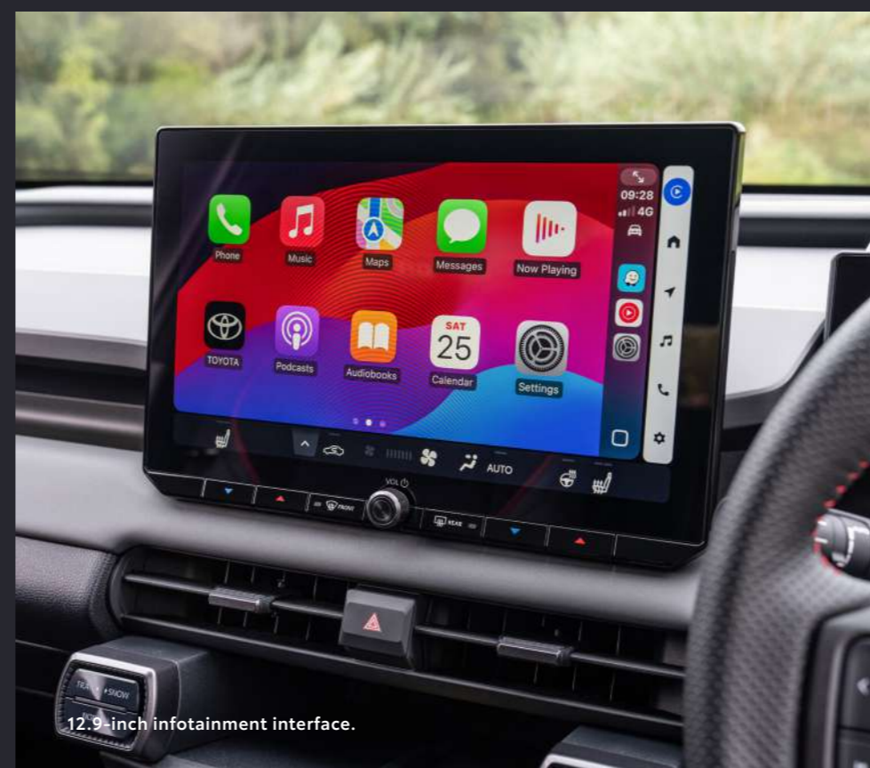
12.9-inch infotainment interface.