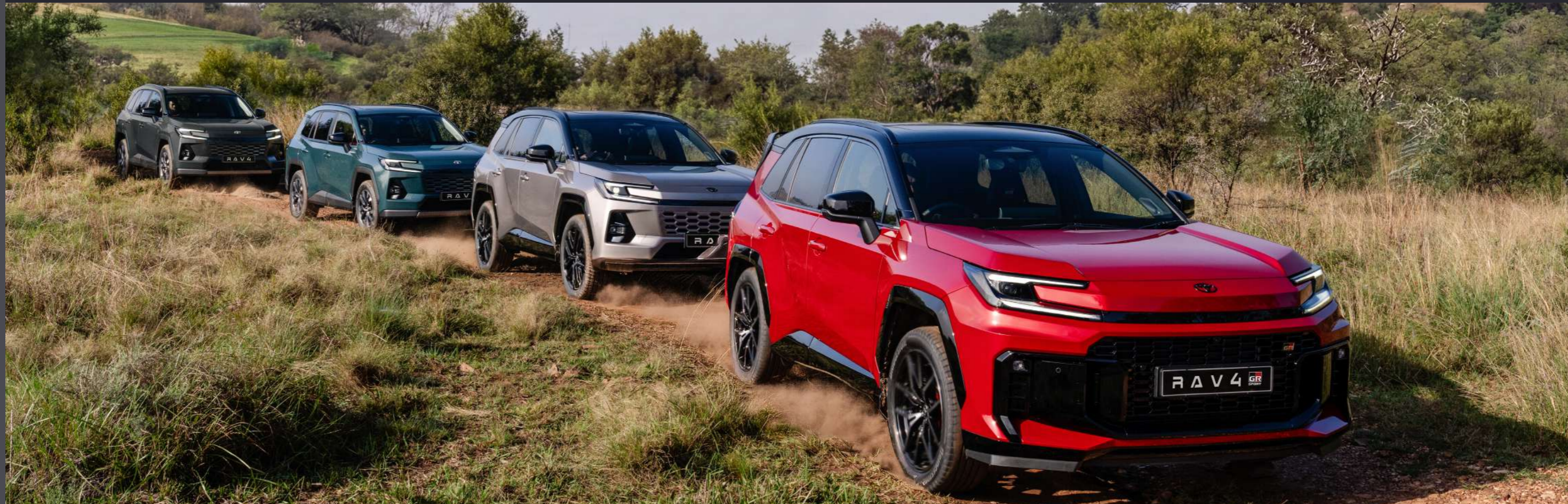
MODELS SHOWN: RAV4 2.5 HEV GR-SPORT, 2.5 PHEV & 2.5 HEV VX