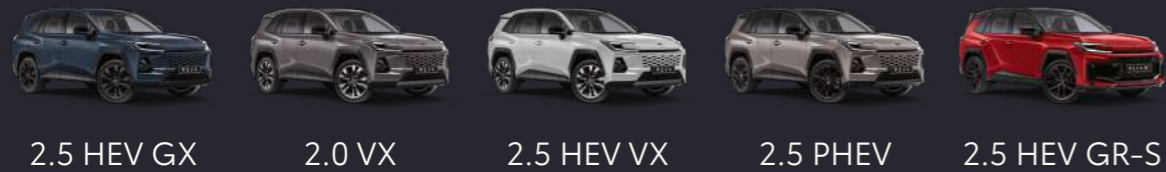
2.5 HEV GX 2.0 VX 2.5 HEV VX 2.5 PHEV 2.5 HEV GR-S