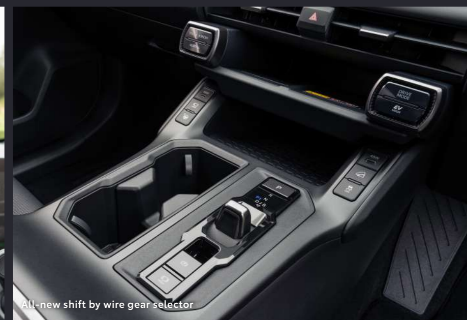
All-new shift by wire gear selector

For a more sophisticated, minimalist interior appearance, the 2.5 HEV VX and 2.5 PHEV introduce a shift-by-wire turn-dial gear selector. The flagship PHEV model, makes every journey ultra-comfortable thanks to power adjustable Sport seats and a keyless, foot activated boot.