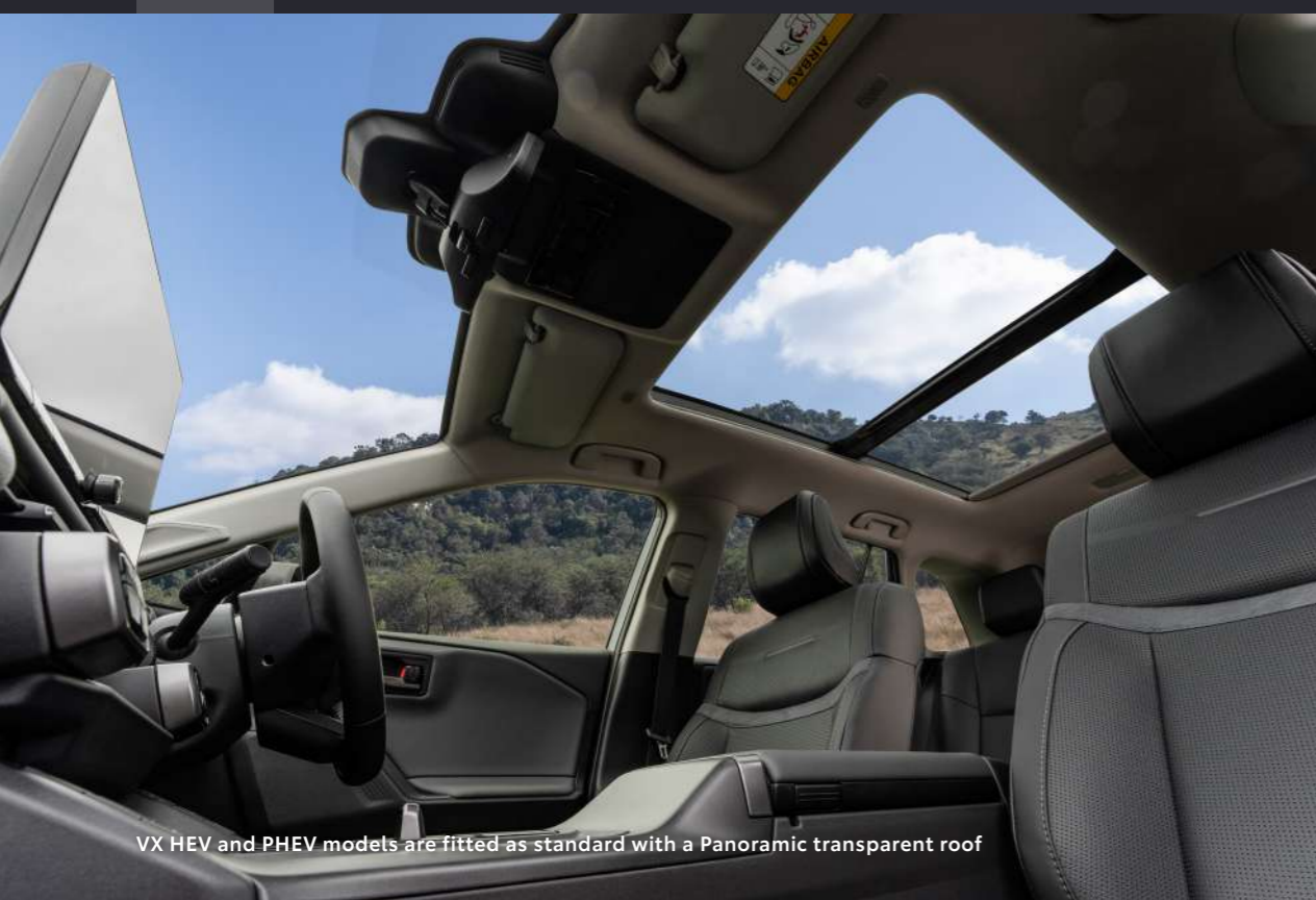
VX HEV and PHEV models are fitted as standard with a Panoramic transparent roof

Comfort is of the essence with heated and ventilated* front and rear leather seats*, a leather-clad steering wheel*, automatically adjusting day/night rear view mirror, and a heads-up display*.