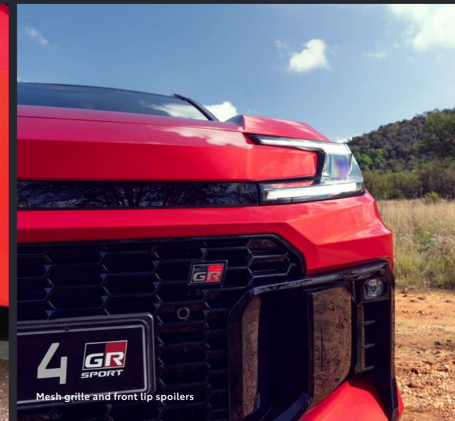
Mesh grille and front lip spoilers