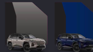
25Q Avant-Garde Bronze Bi-Tone M40 Moonlight Ocean Metallic Bi-Tone