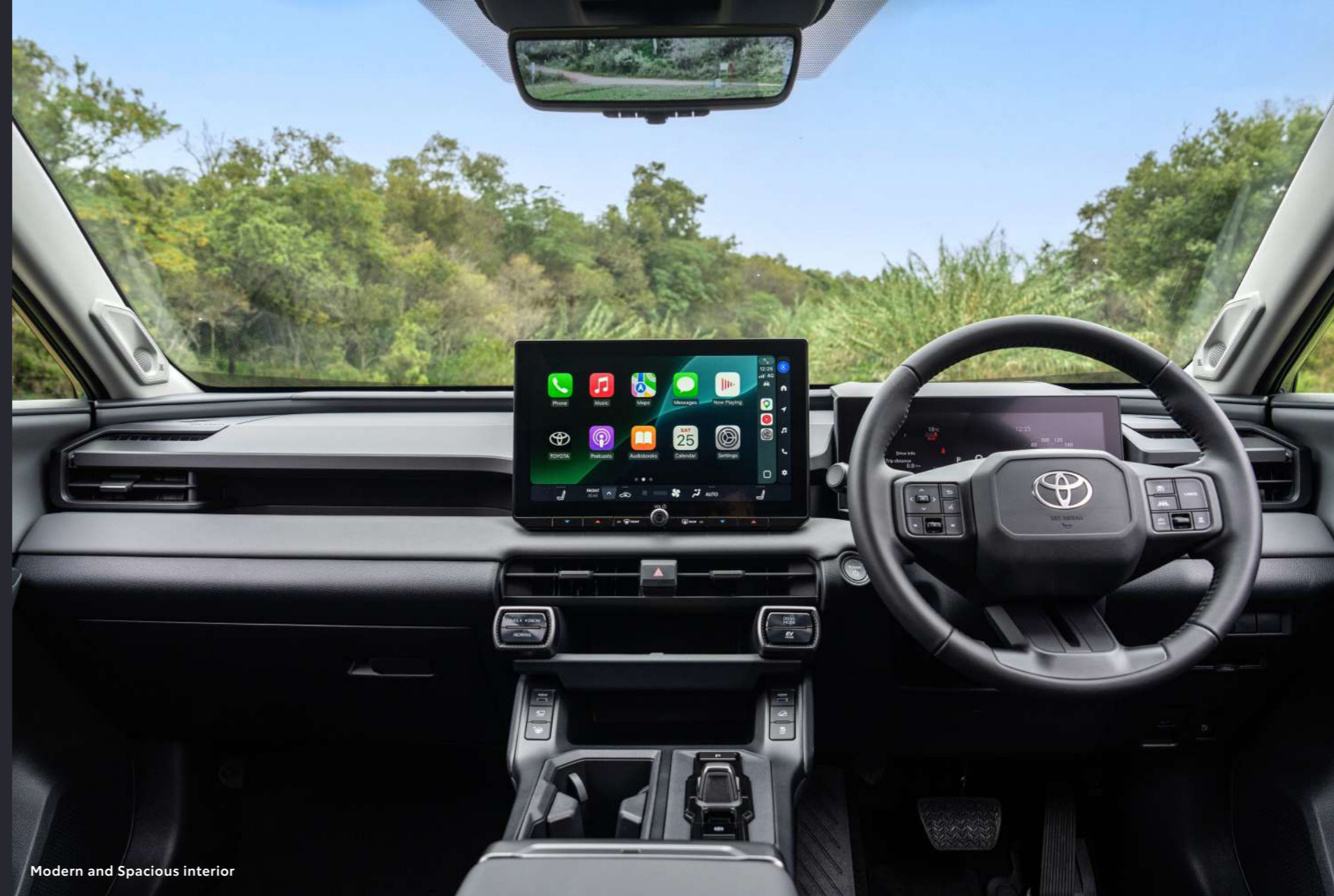
Modern and Spacious interior

Comfort is of the essence with heated and ventilated* front and rear leather seats*, a leather-clad steering wheel*, automatically adjusting day/night rear view mirror, and a heads-up display*.