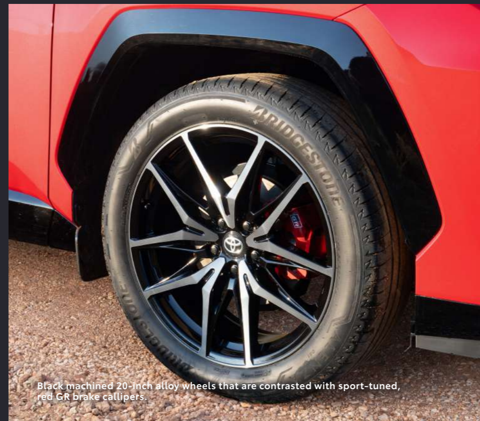
Black machined 20-inch alloy wheels that are contrasted with sport-tuned, red GR brake callipers.