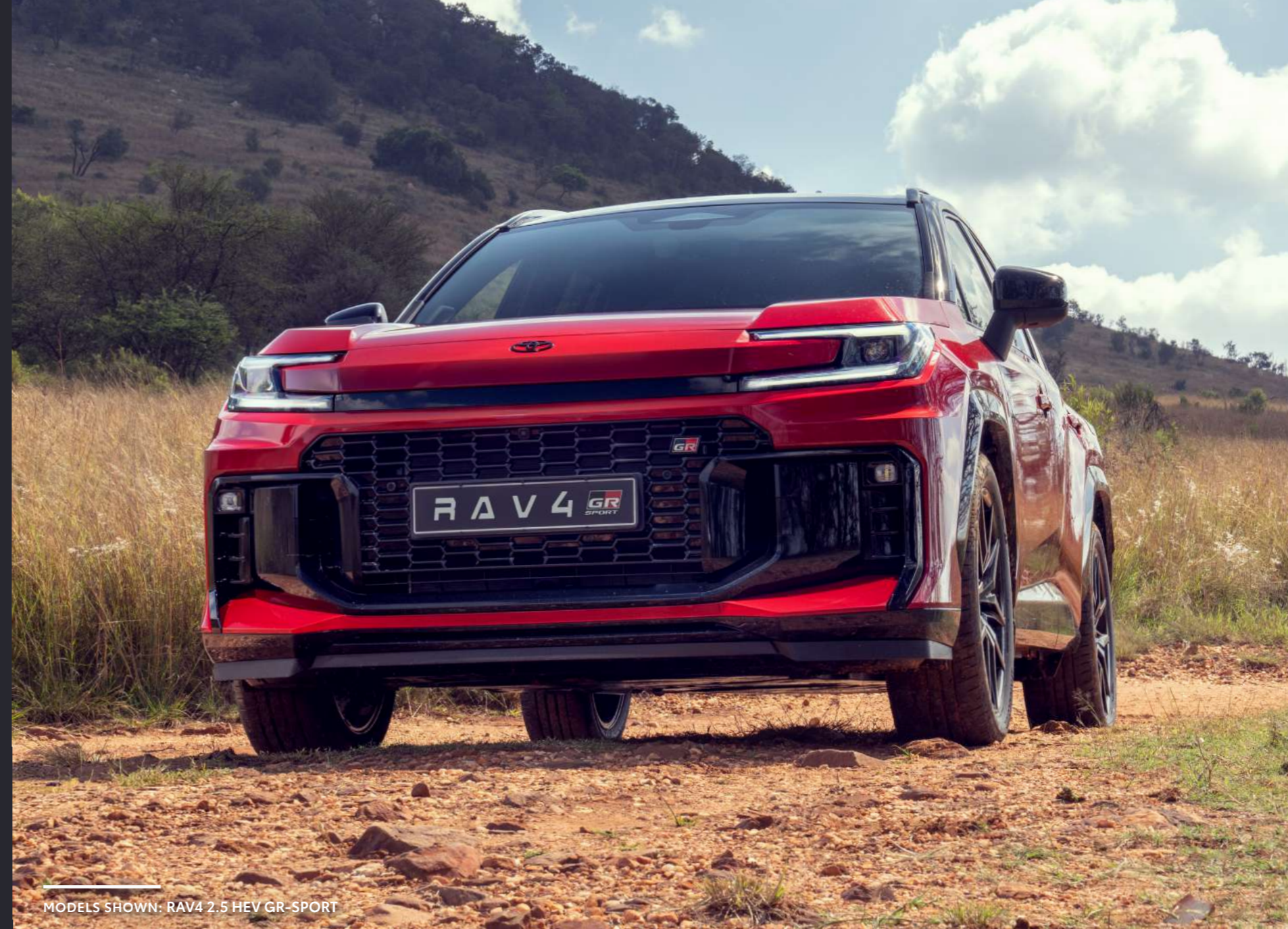
MODELS SHOWN: RAV4 2.5 HEV GR-SPORT

Choose from four bi-tone colours to match your adventurous spirit.