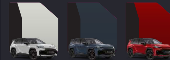
2VP Platinum White Bi-Tone M22 Smokey Blue Bi-Tone 2TB Passion Red Bi-Tone