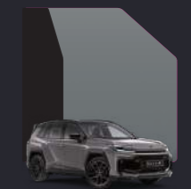
M38 Moon Grey Bi-Tone