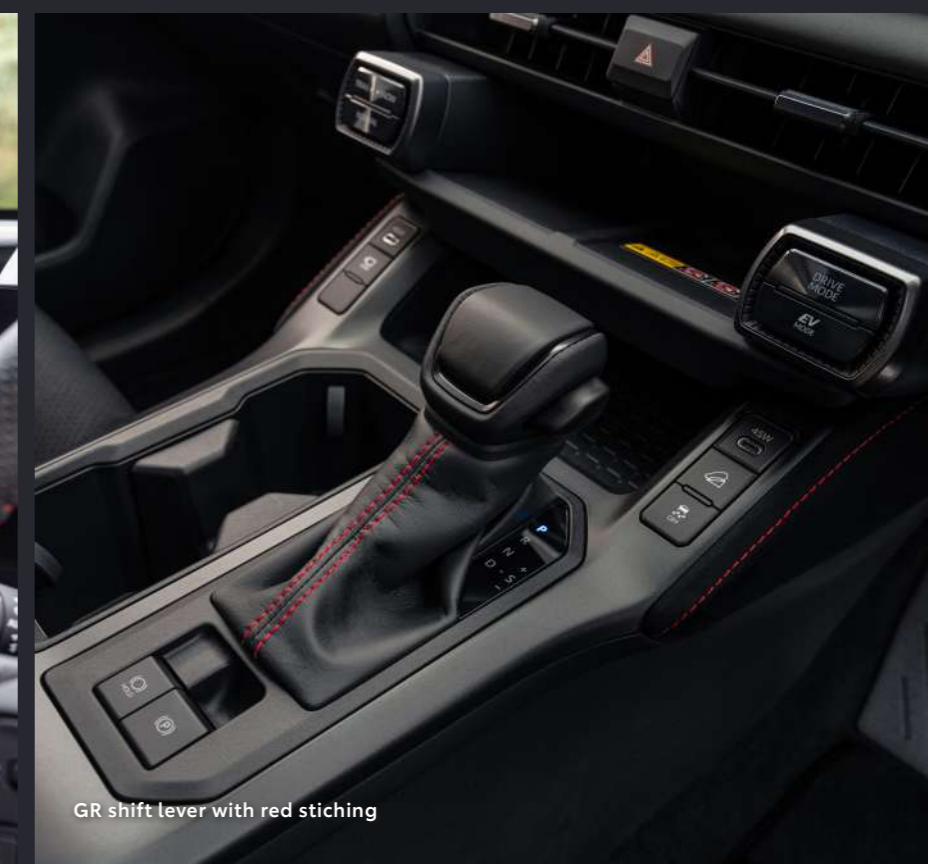
GR shift lever with red stitching