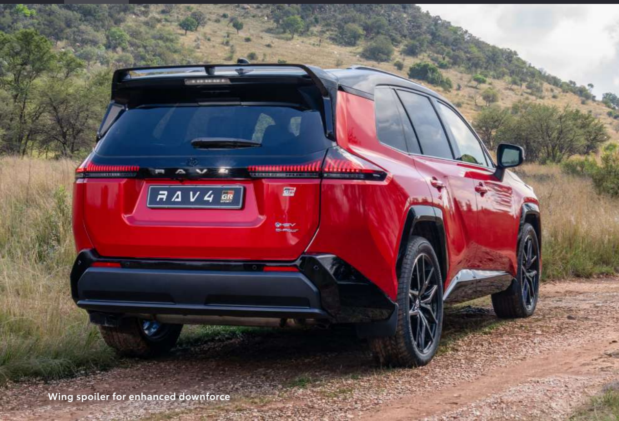
Wing spoiler for enhanced downforce