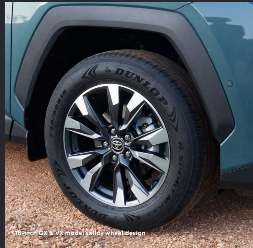
18-inch GX & VX model alloy wheel design