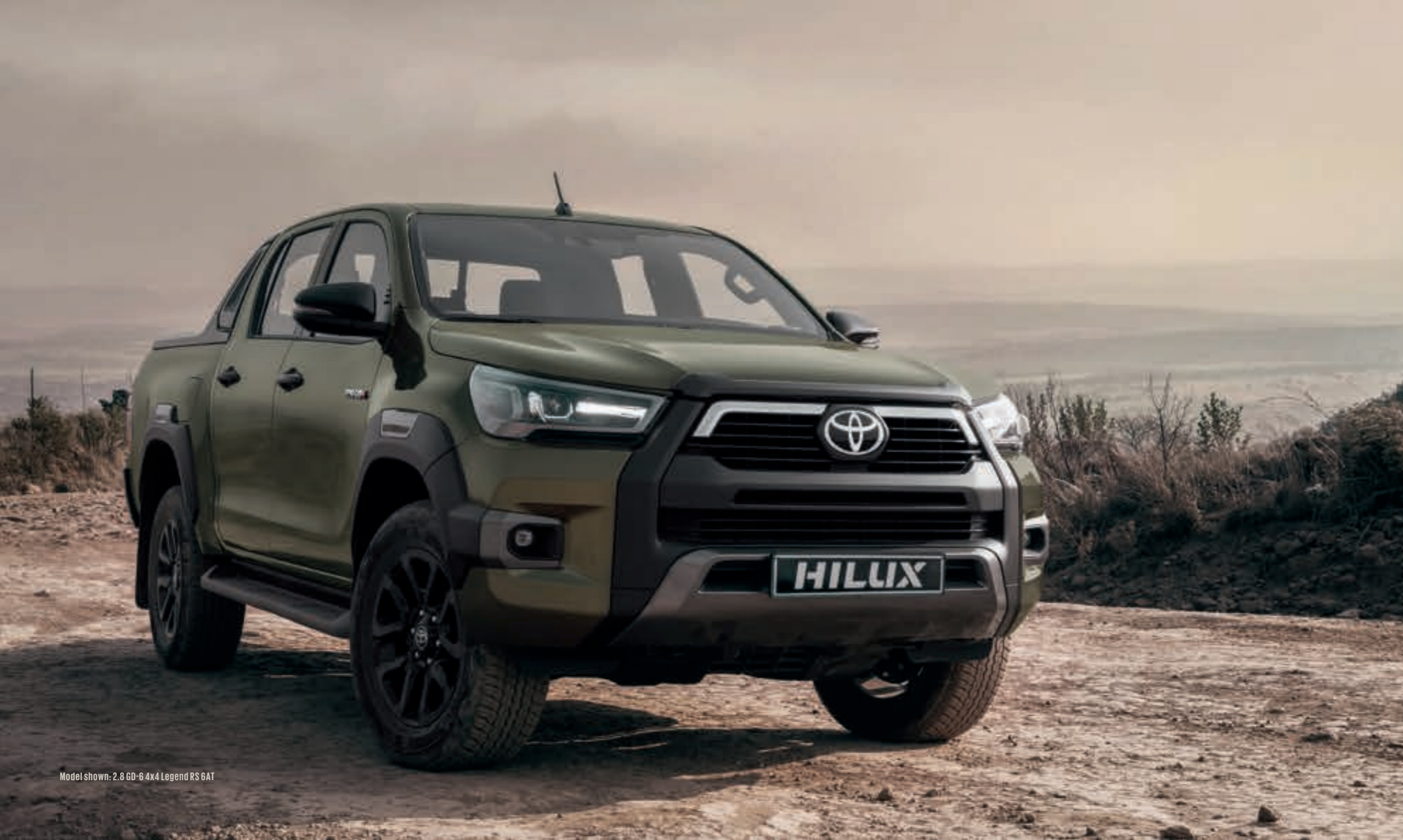
Model shown: 2.8 GD-6 4x4 Legend RS 6AT