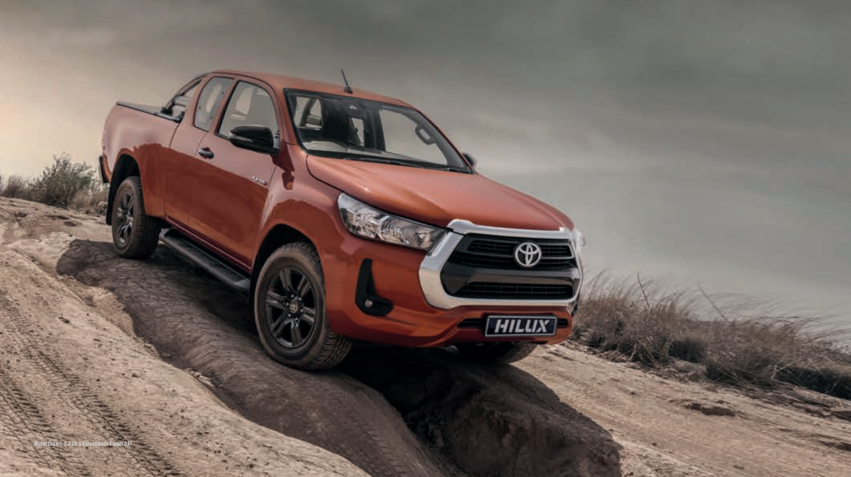
Model shown: 2.4 GD-6 Raised Body Raider 6AT