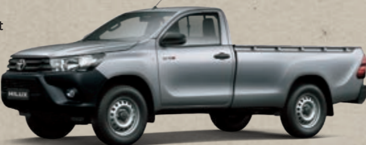
MODEL SHOWN: HILUX 2.4 GD-6 RB SR 6MT

Drivers can look forward to one-touch driver* electric window operation, and air conditioner*.