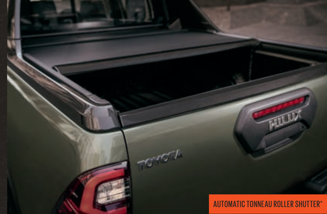
AUTOMATIC TONNEAU ROLLER SHUTTER*