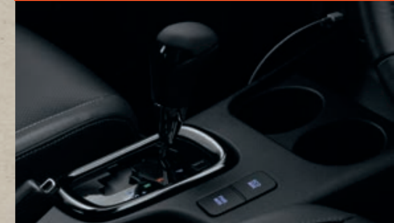
LEATHER-CLAD GEAR SELECTOR*