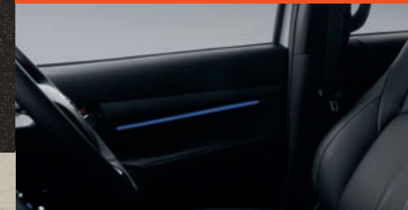
BLUE AMBIENT LIGHTING*