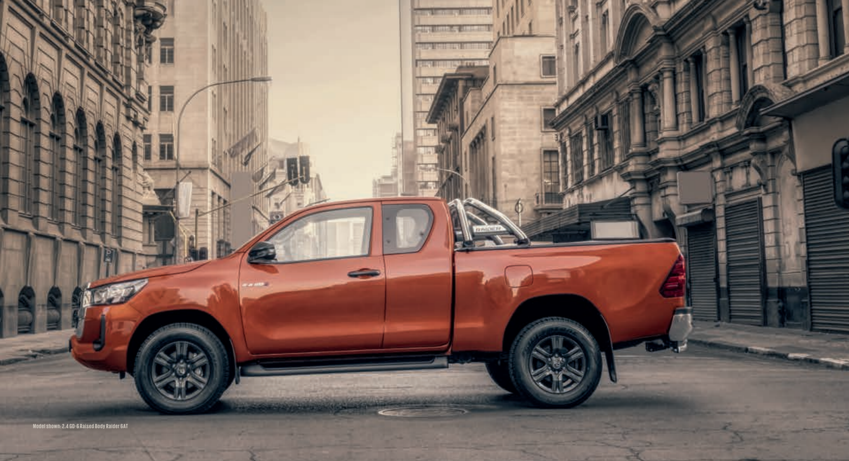
Model shown: 2.4 GD-6 Raised Body Raider 6AT