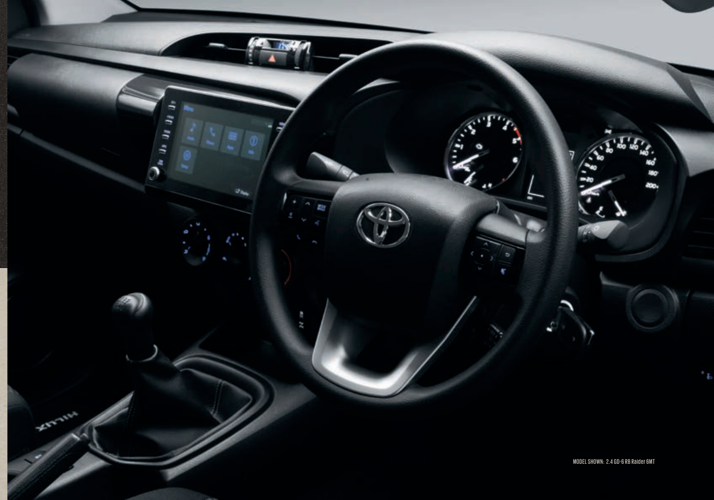
MODEL SHOWN: 2.4 GD-6 RB Raider 6MT