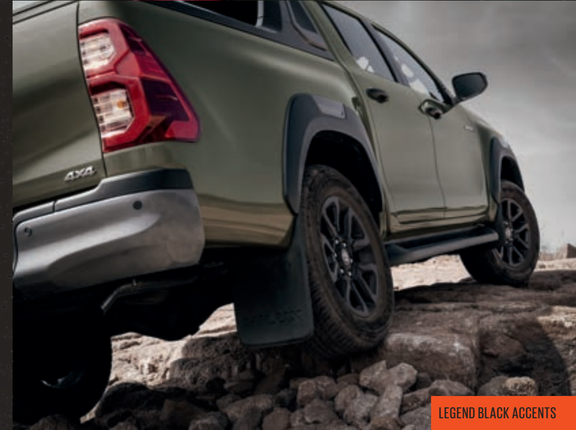
LEGEND BLACK ACCENTS