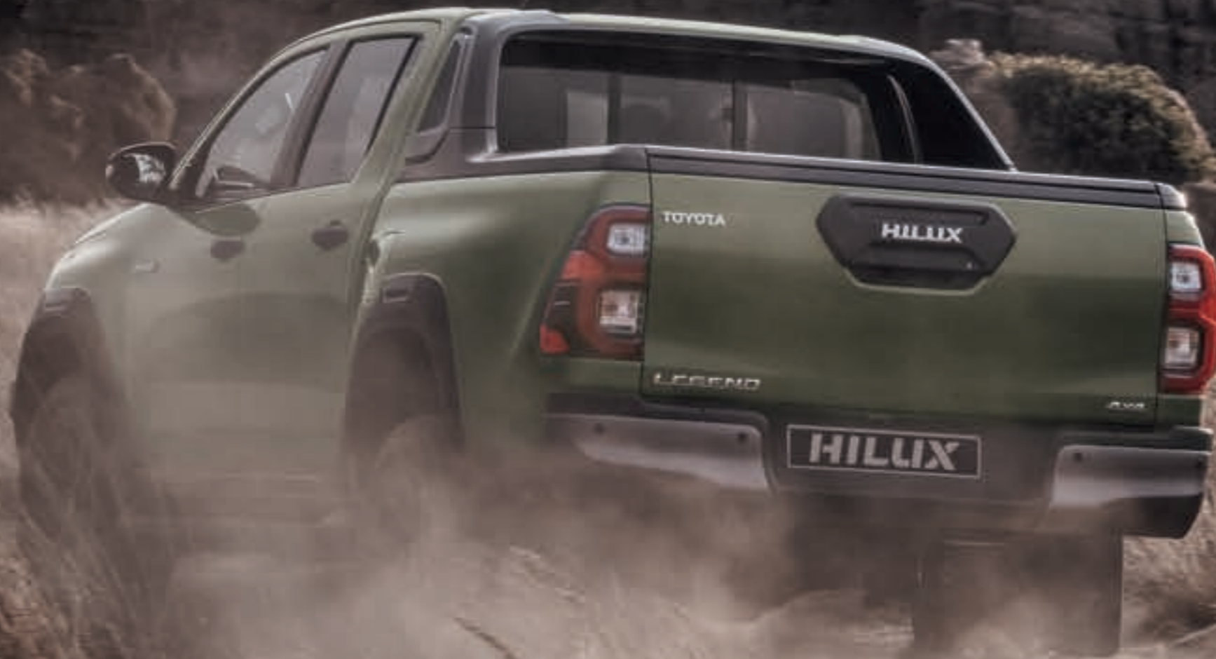
Model shown: 2.8 GD-6 4x4 Legend RS 6AT

LEGENDARY TOUGHNESS REQUIRES LEGENDARY POWER. HELPING YOU WELCOME ANY CHALLENGE IS A RANGE OF PETROL AND TURBODIESEL ENGINES, FITTED WITH EITHER 5-SPEED OR 6-SPEED MANUAL OR 6-SPEED AUTOMATIC TRANSMISSIONS.