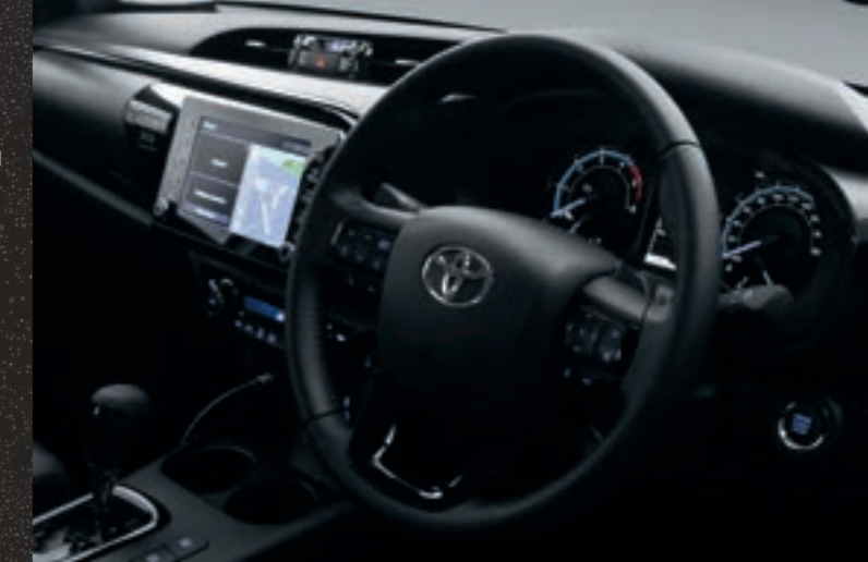
LEATHER-CLAD STEERING WHEEL*