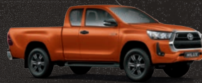
MODEL SHOWN: HILUX 2.4GD-6 RB Raider 6AT

Additionally, the Display Audio infotainment unit has been upgraded to incorporate Apple CarPlay and Android Auto for full smart phone integration with the vehicle's infotainment system.