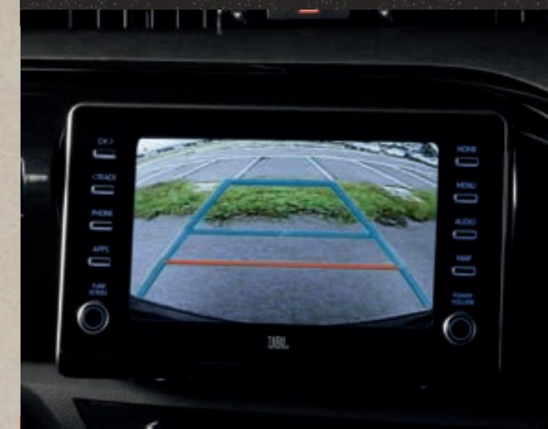
REVERSE CAMERA DISPLAY*