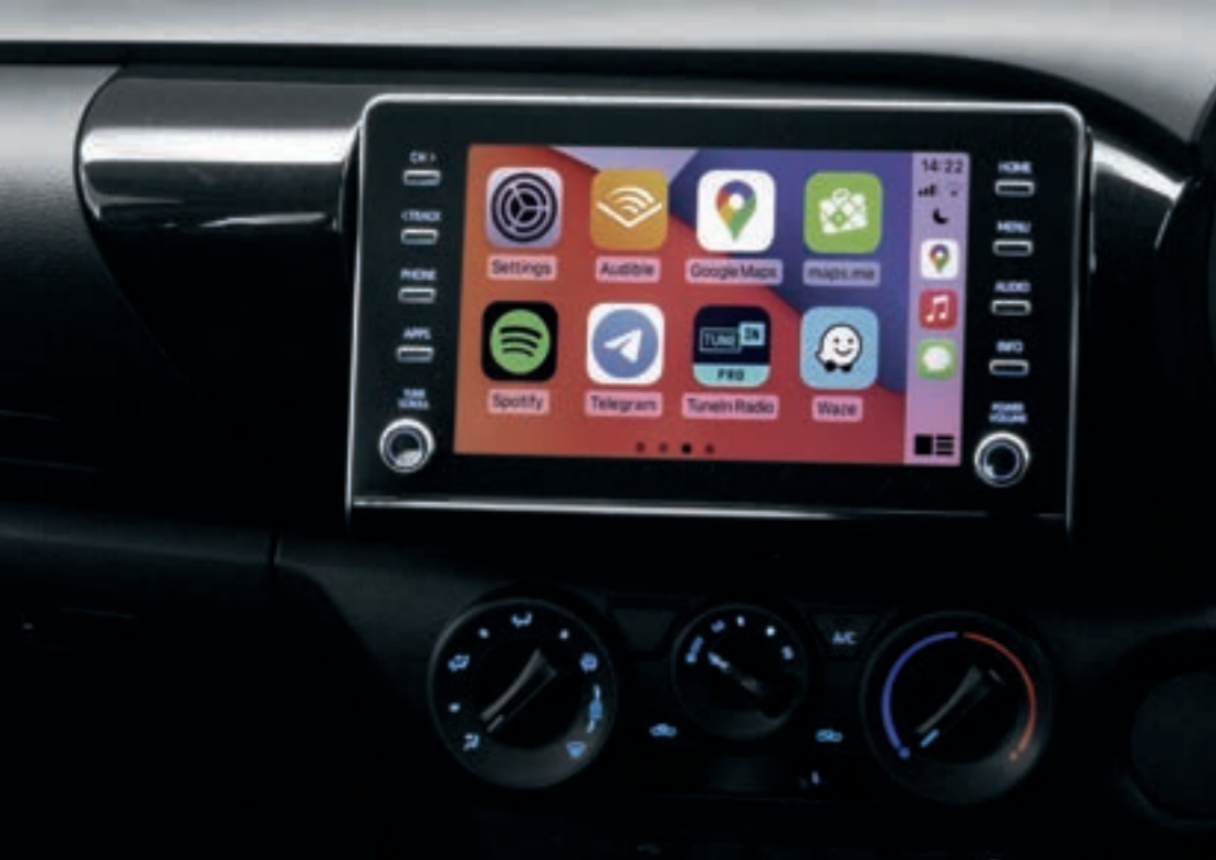
RAIDER: TOUCH SCREEN DISPLAY AUDIO