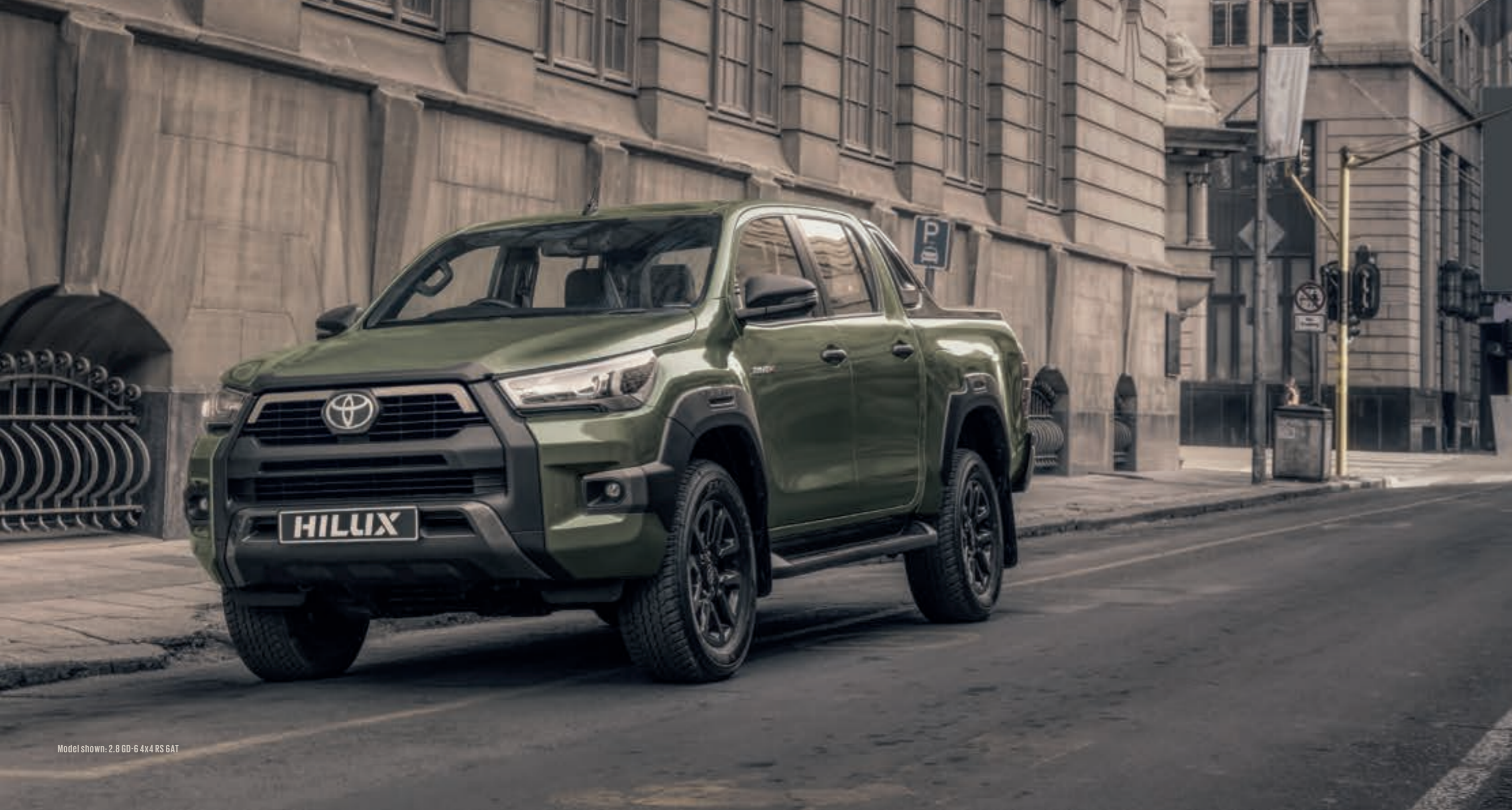
Model shown: 2.8 GD-6 4x4 RS 6AT