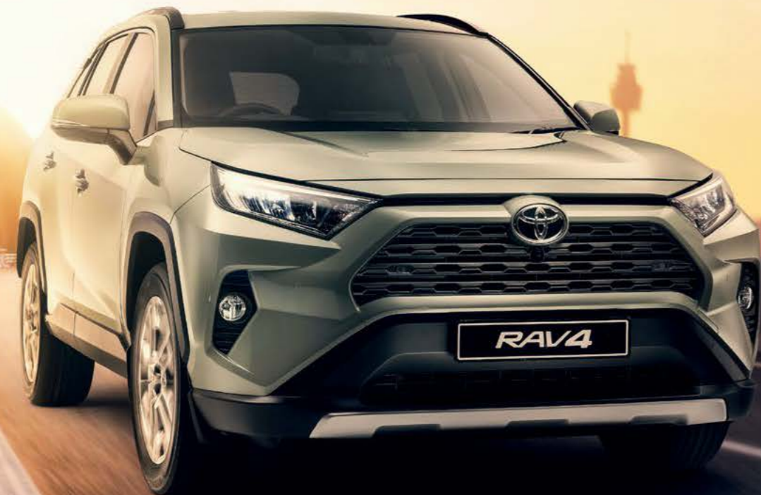
MODEL SHOWN 2.5 VX AT AWD

'INCREDIBLE' IS IN THE PEACE OF MIND OF KNOWING YOU CAN LIVE YOUR LIFE TO THE FULLEST AND BE SAFE AND SECURE WHILE DOING IT. THE RAV4 ENSURES THIS WITH AN EXTENSIVE RANGE OF ACTIVE AND PASSIVE SAFETY SYSTEMS.