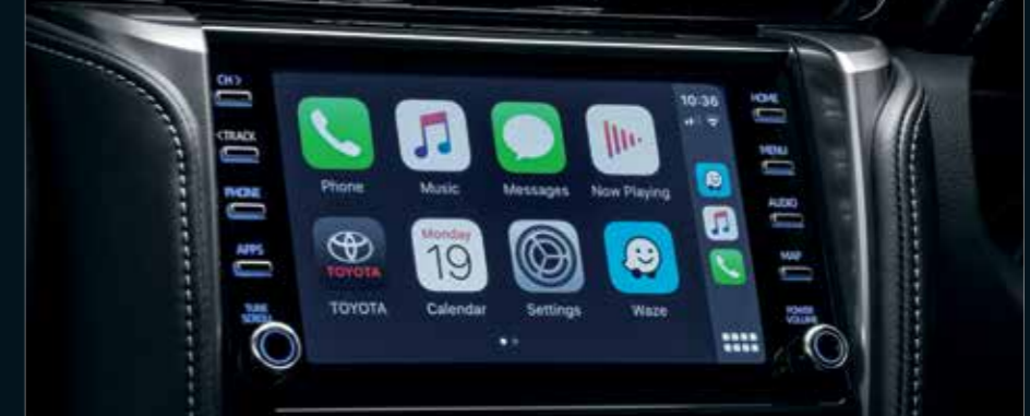
Apple CarPlay and Android Auto