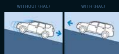
HILL-ASSIST CONTROL (HAC)