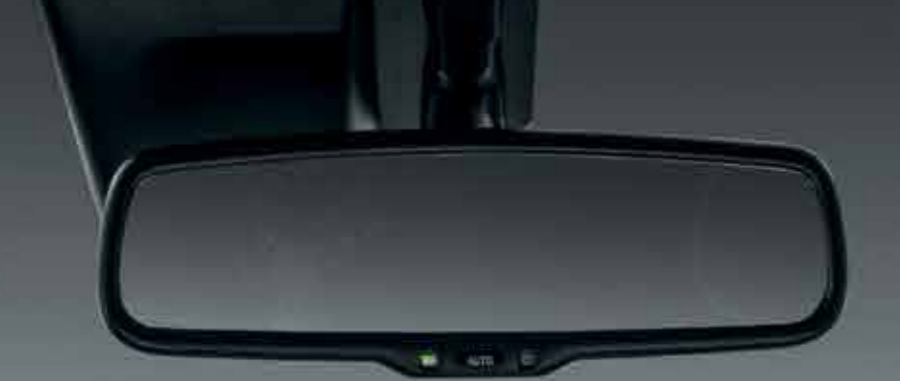
Electrochromatic rear view mirror

The Fortuner's technological dexterity continues with the infotainment system, which has been upgraded to an 8" touch screen unit which comprises Bluetooth and USB compatibility and is linked to 11 JBL* speakers. The screen also doubles as the display monitor for the vehicle's reverse camera..