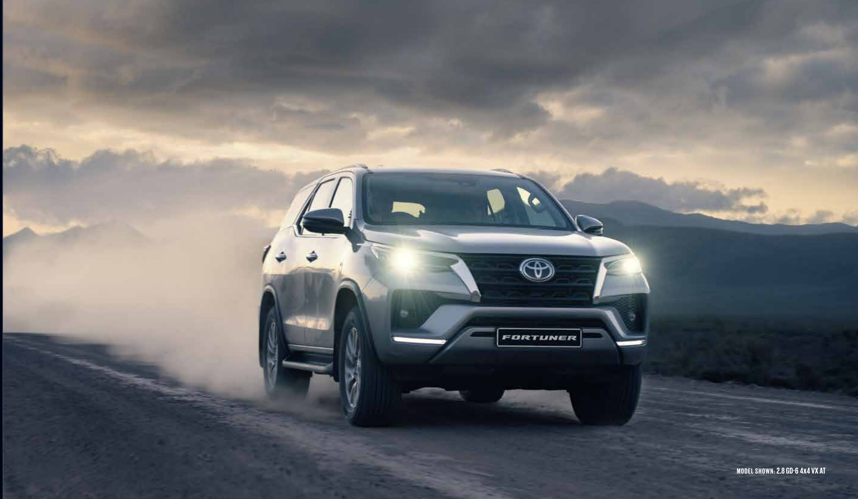
MODEL SHOWN: 2.8 GD-6 4x4 VX AT