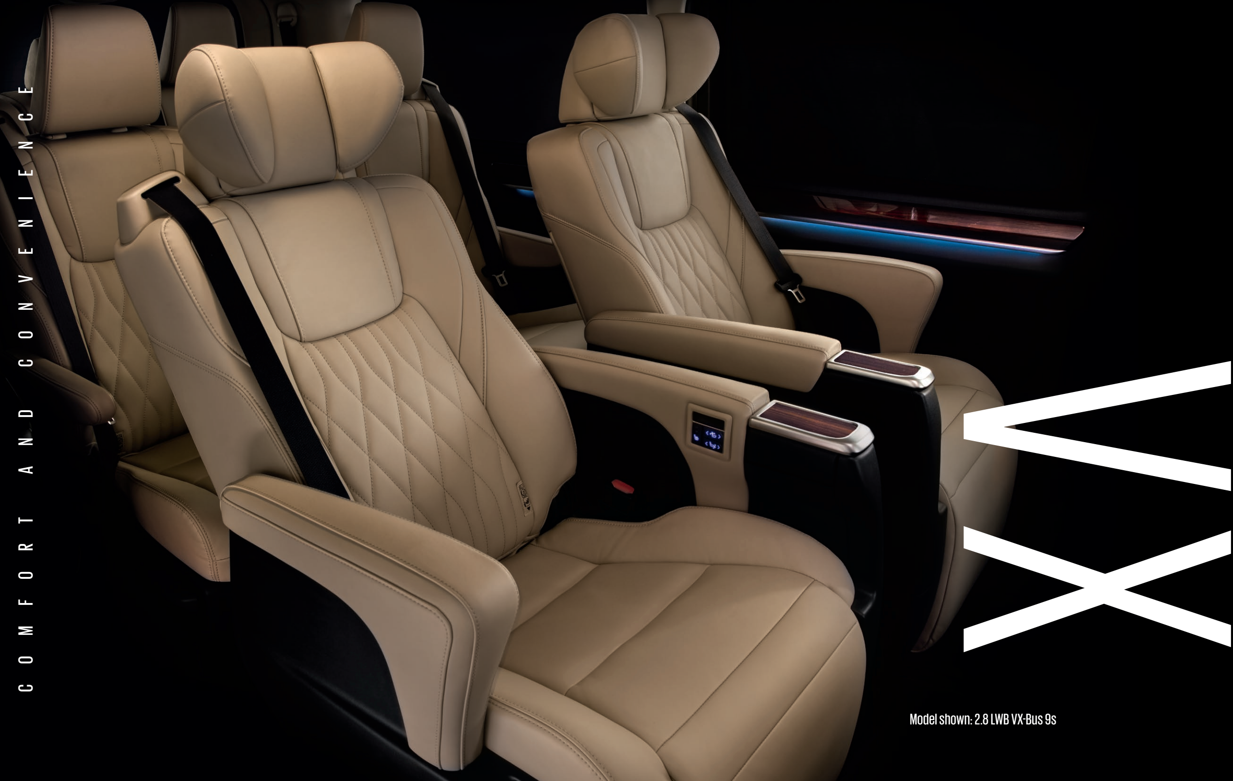
Model shown: 2.8 LWB VX-Bus 9s

C O M F O R T A N D C O N V E N I E N C E