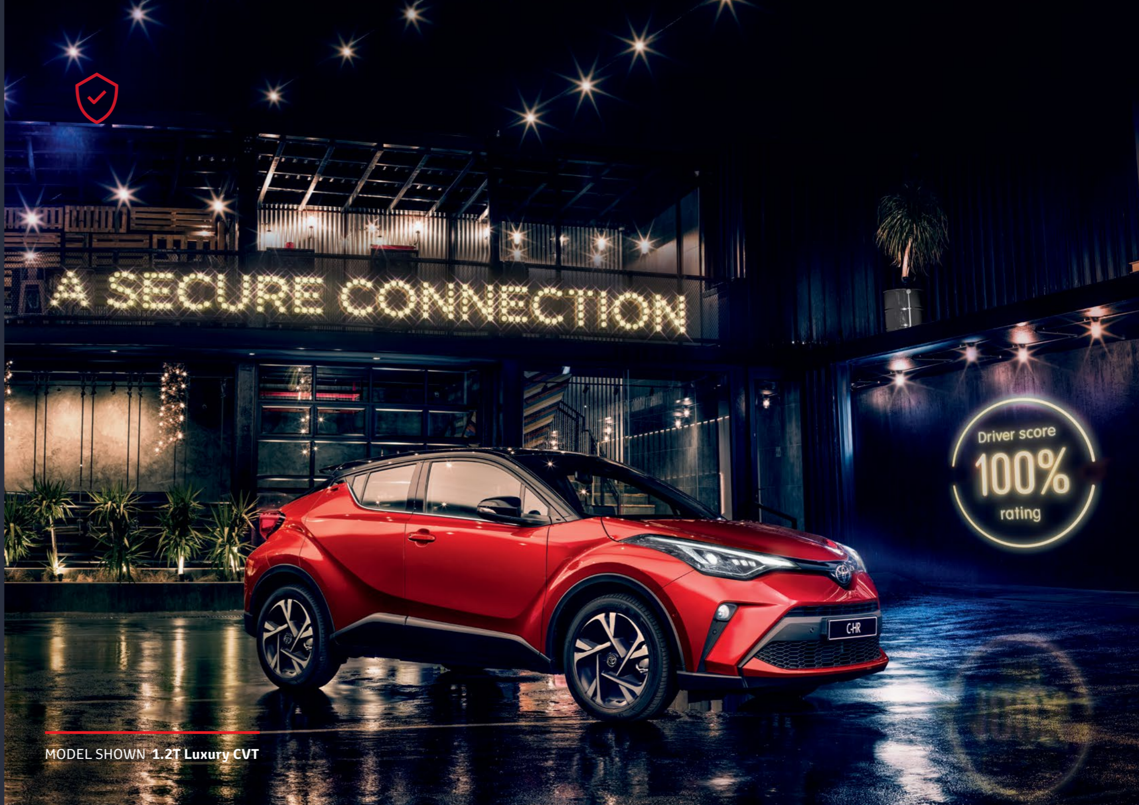
MODEL SHOWN 1.2T Luxury CVT