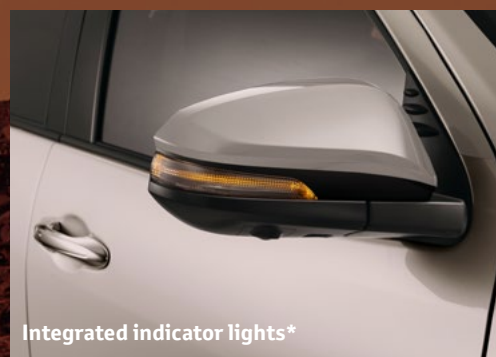
Integrated indicator lights*