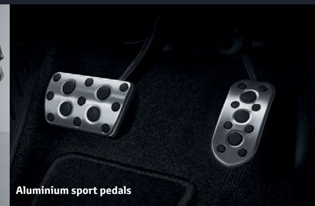
Aluminium sport pedals