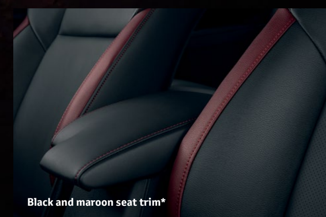
Black and maroon seat trim*