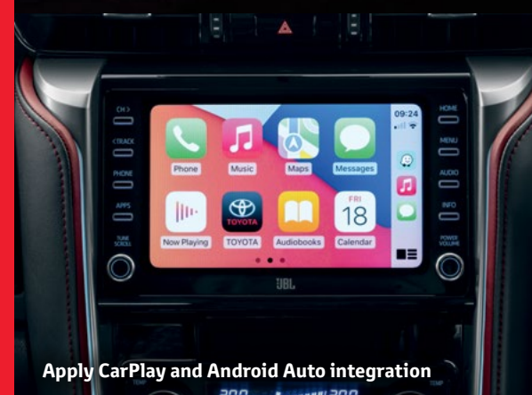
Apply CarPlay and Android Auto integration