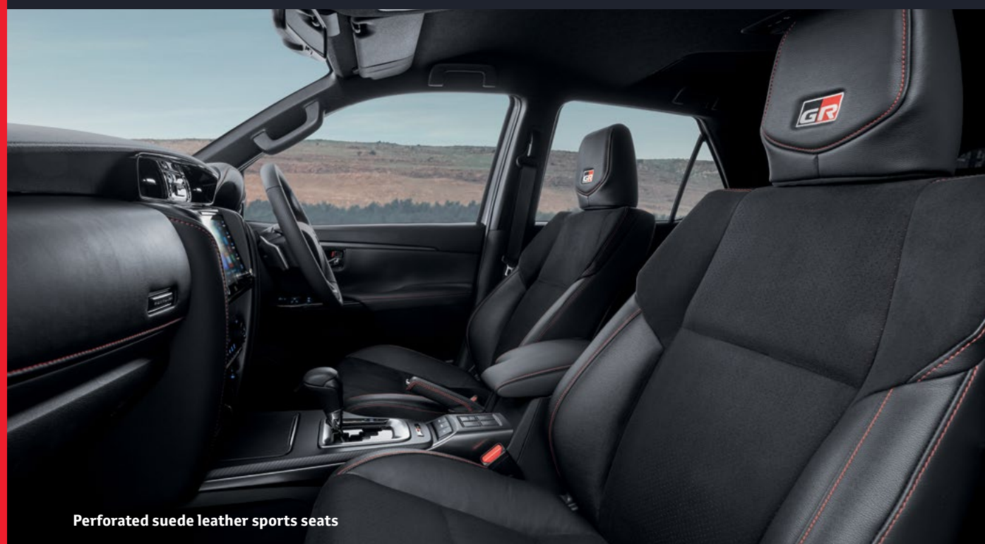
Perforated suede leather sports seats