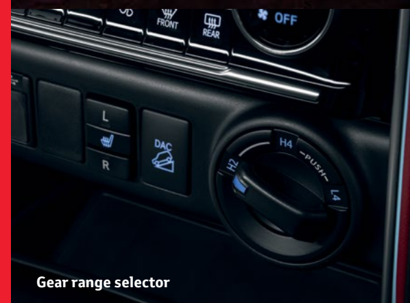
Gear range selector