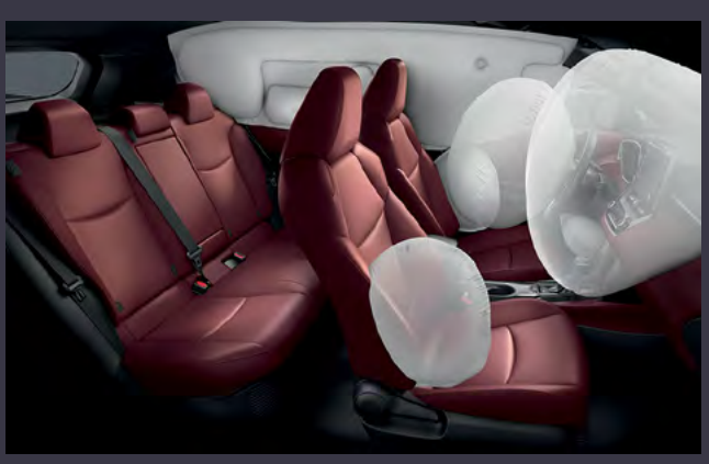
*Available on selected models

To keep occupants safe in the event of a collision, the Corolla Cross is equipped with up to seven airbags, distributed as driver, front passenger, driver-knee, front side and curtain* airbags.