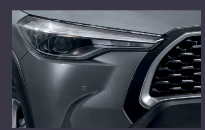
DISTINCTIVE LED* HEADLAMPS

At the rear, large elliptical taillamps with trapezoidal detailing and crease lines provide a sleek and sophisticated look, flanking the rear door that has been designed for optimal ease of accessibility. The result is a vehicle that provides an uncompromised cross between form and functionality.