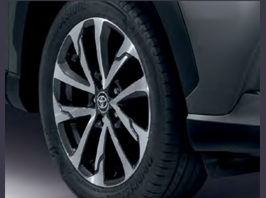
18"* ALLOY WHEELS