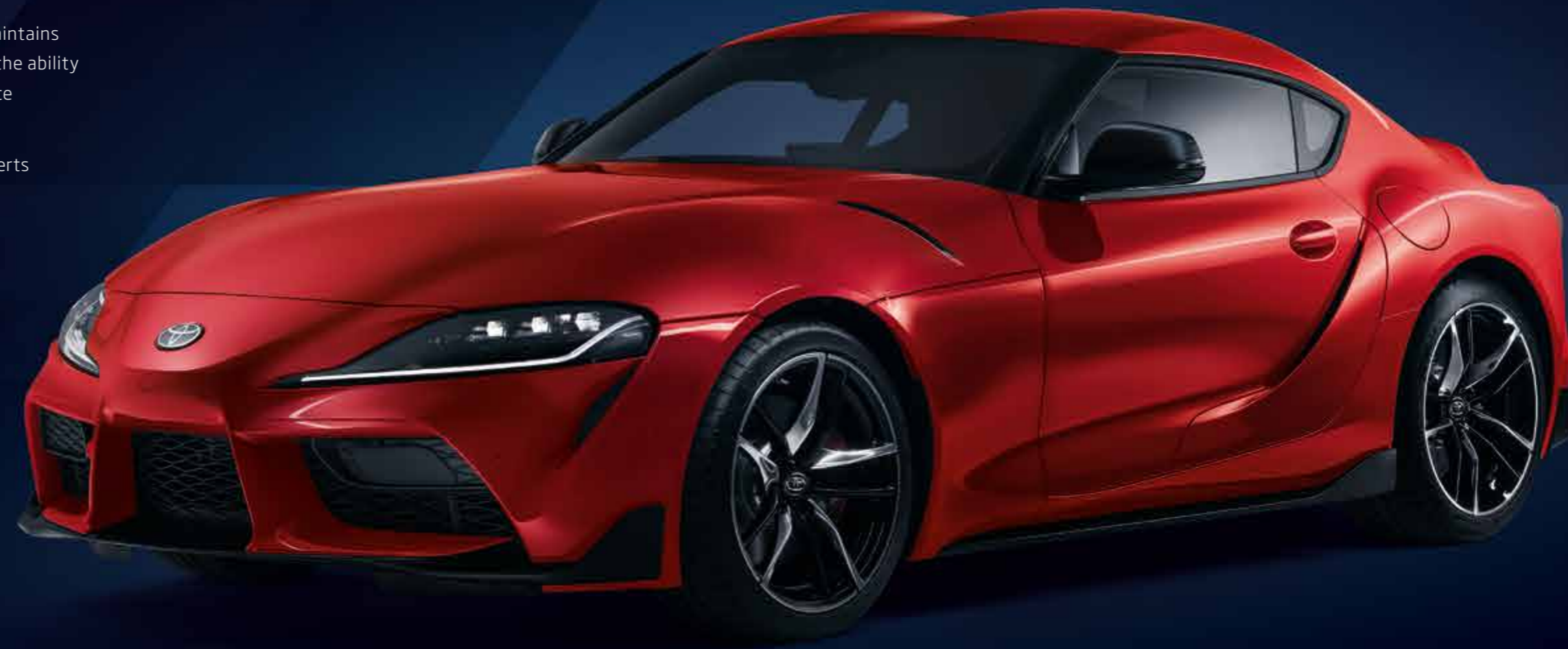
MODEL SHOWN: GR SUPRA