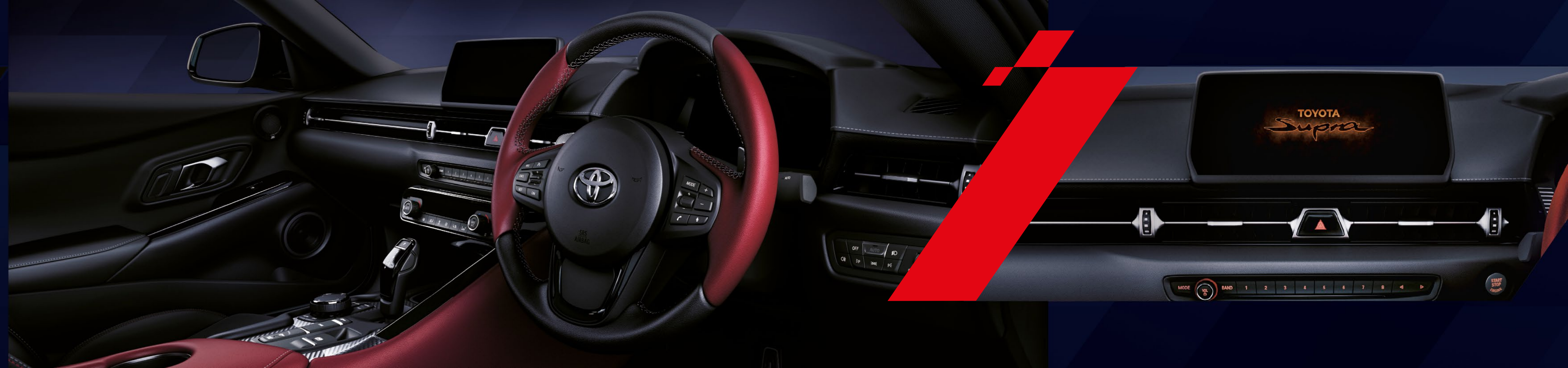
INTERIOR SHOWN: GR SUPRA