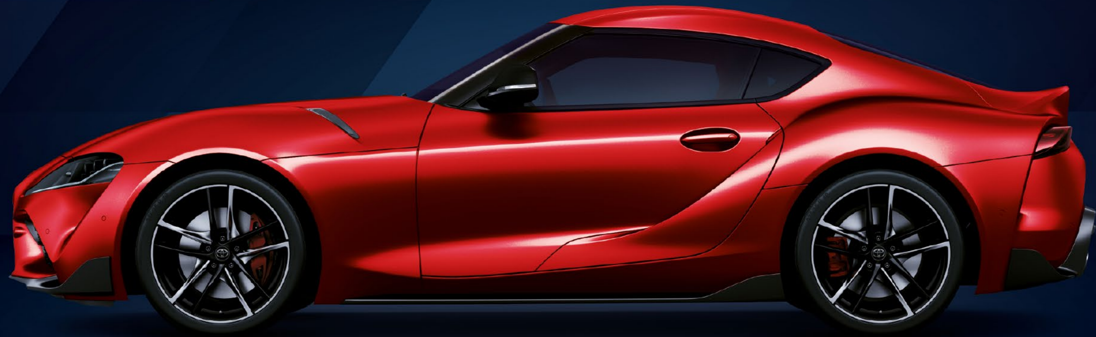
MODEL SHOWN: GR SUPRA