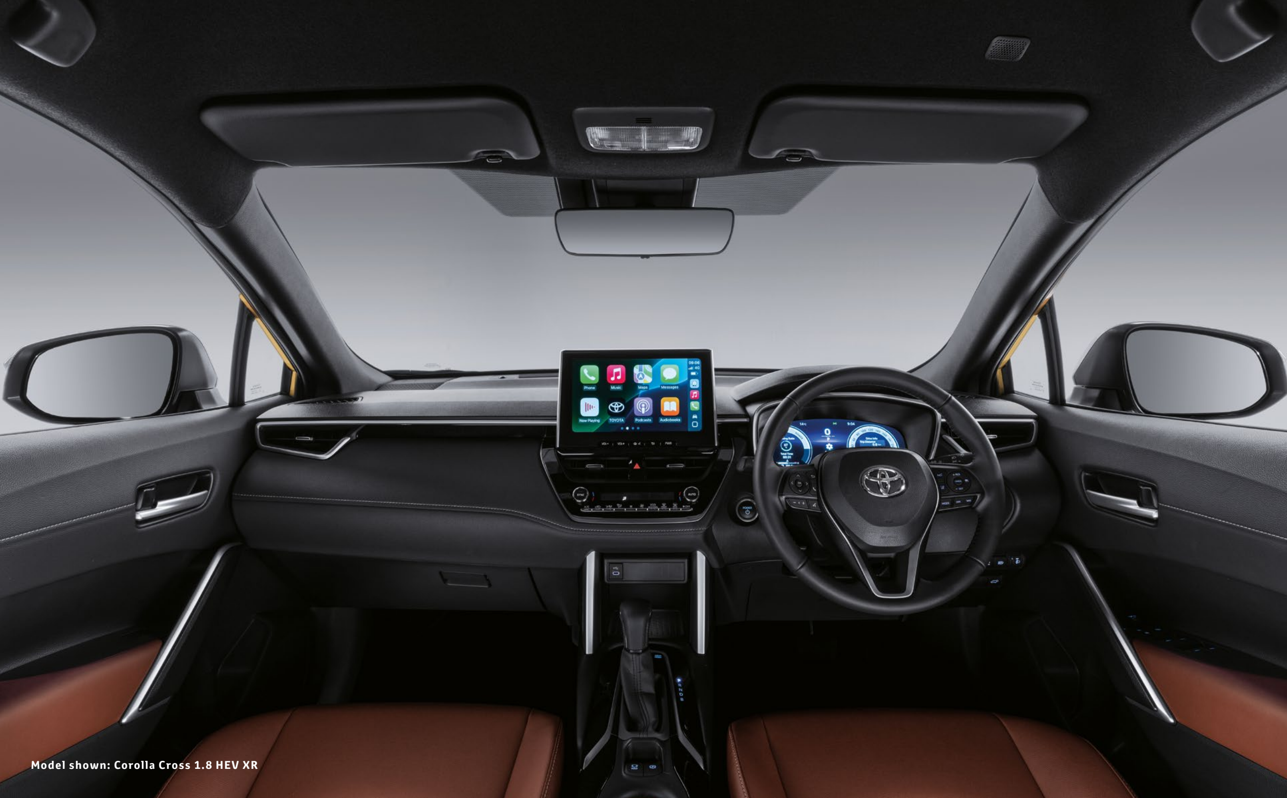
Model shown: Corolla Cross 1.8 HEV XR