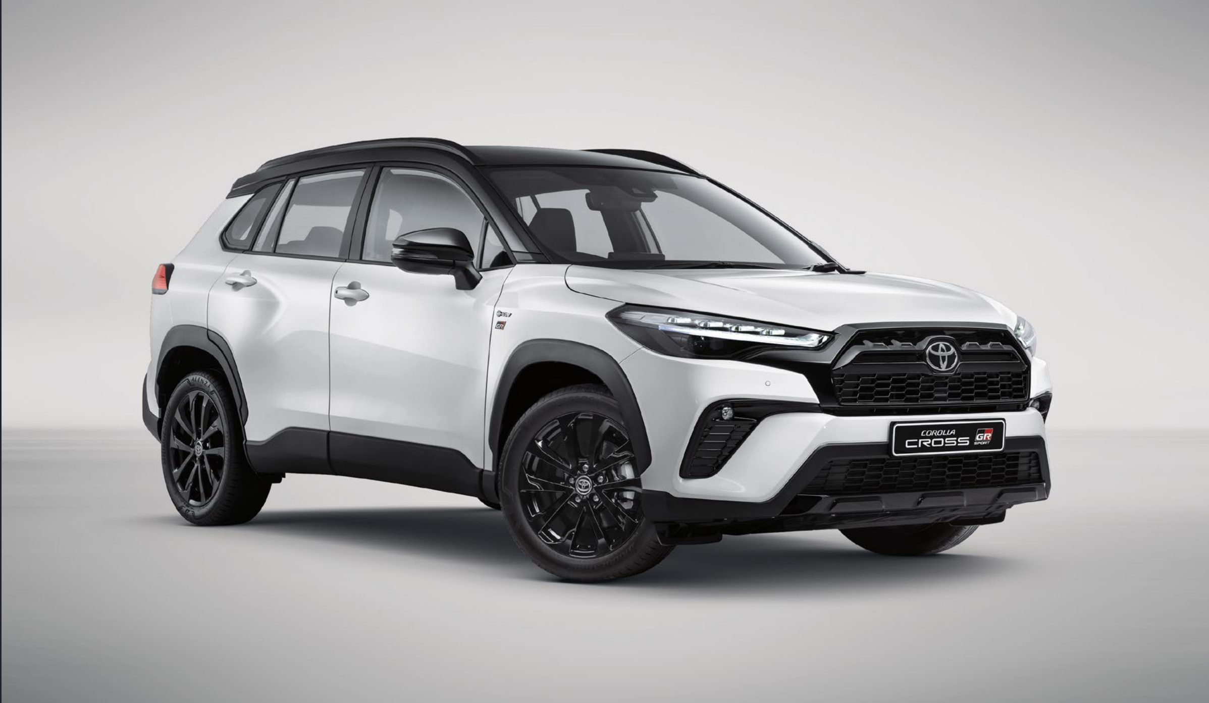
Model shown: Corolla Cross 1.8 HEV GR-Sport