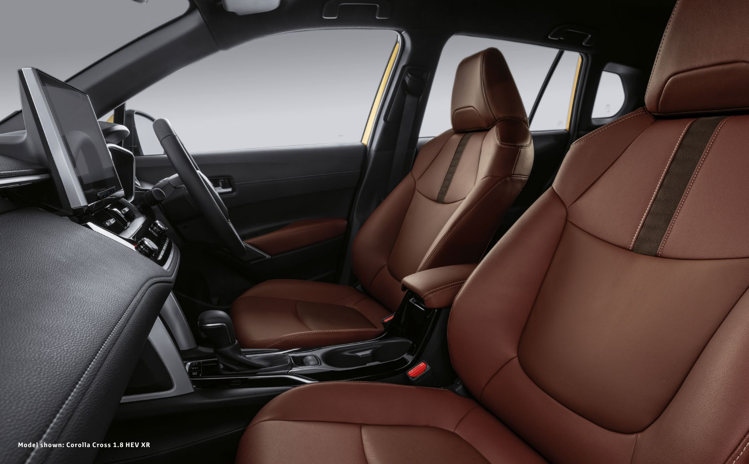
Model shown: Corolla Cross 1.8 HEV XR