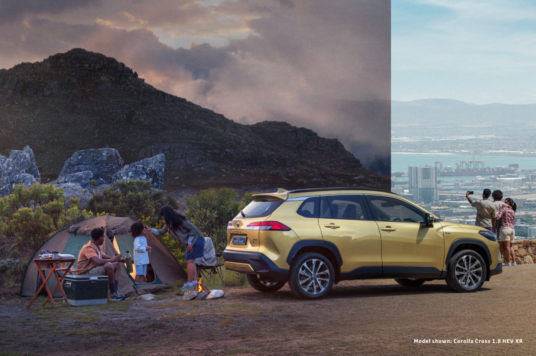
Model shown: Corolla Cross 1.8 HEV XR