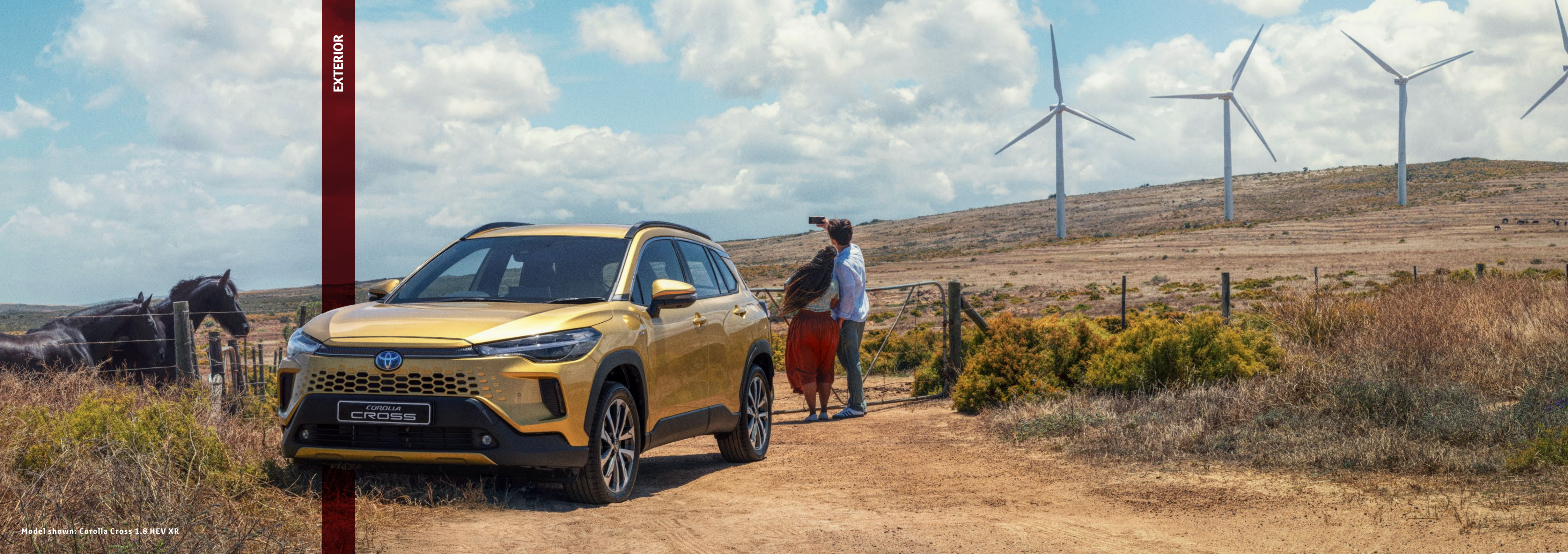
Model shown: Corolla Cross 1.8 HEV XR