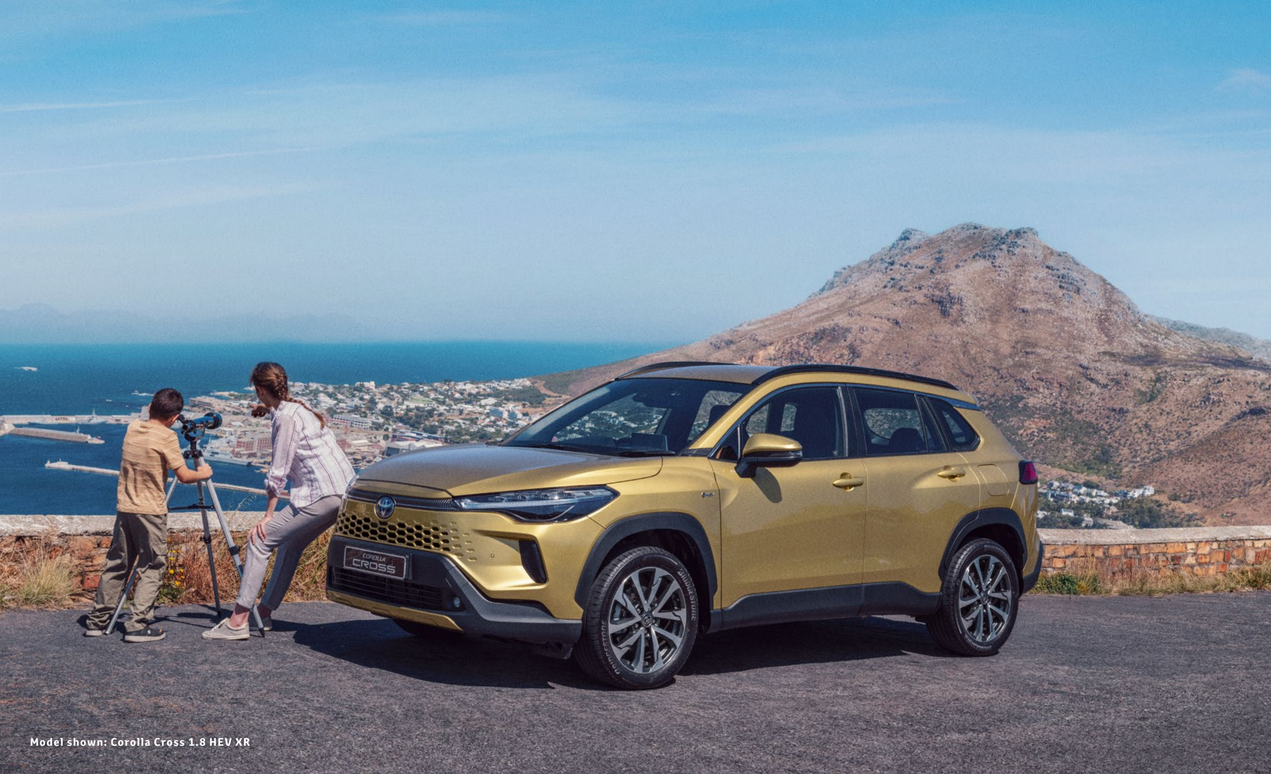
Model shown: Corolla Cross 1.8 HEV XR